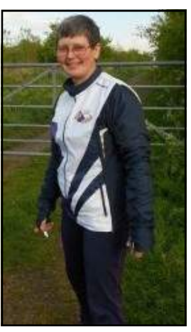
Warm up top £32 Trousers £20

http://media.wix.com/ugd/c6b803_1ade477dfbaf4217b184c202de1911b9.pdf for a sizing guide the for top three items.