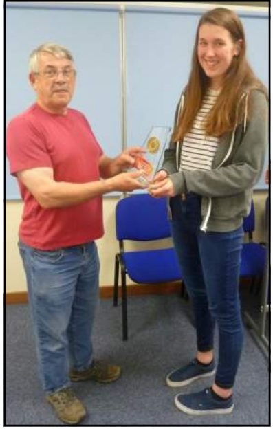
Summer league 2015 - highest placed female