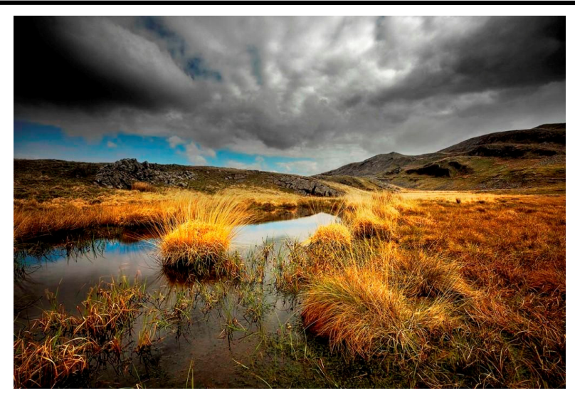
A glimpse of the area for day 3. The area is Mynydd Llangynidr and is adjacent to Merthyr Common which will host day 2.