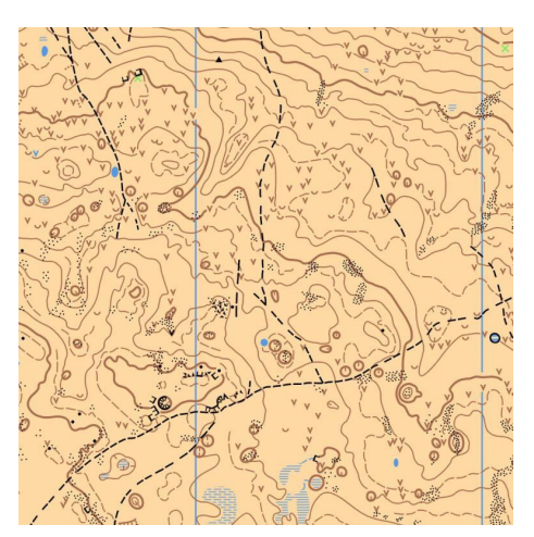
Map extract from Mynydd Llangynidr', the area where LEI will be hosting day 3 of the JK2014.