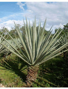
Sisal, picture courtesy of Wikipedia

was not as runnable as mapped. The open ground between controls 2, 3 and 4 was anything but open. Closely packed, impenetrable, bamboo like vegetation well over head height confronted runners – a long detour was necessary. Secondly, I still need to do more hot weather running acclimatization training Thirdly, the rough open ground around control 9 comprised the Florida equivalent of