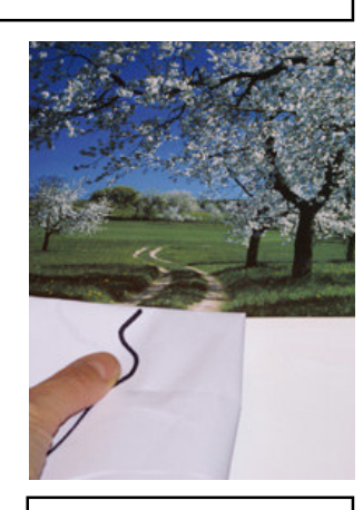
Orientating the map

to fold and thumb the map and keep it orientated all time. This was partly achieved by the use of display boards with illustrations of the various techniques (see photos alongside) along with information on upcoming events and leaflets on various aspects of our sport.