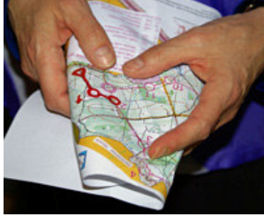
Folding the map

to fold and thumb the map and keep it orientated all time. This was partly achieved by the use of display boards with illustrations of the various techniques (see photos alongside) along with information on upcoming events and leaflets on various aspects of our sport.