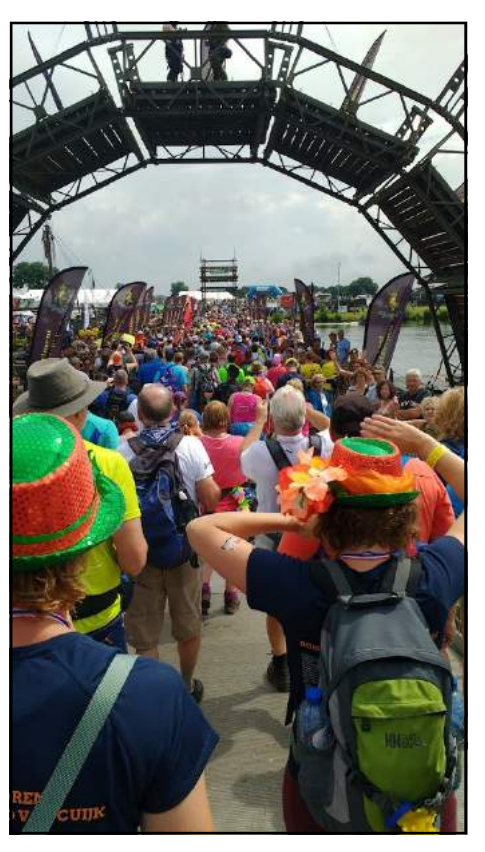
Walkers on the pontoon bridge at Cuijk.

refreshments. Nearly every street has a hi-fi system blasting out music as you walk past, even at 5.00am! The number of times we heard 'You'll Never Walk Alone' was unbelievable. As the day wore on, we passed through towns and villages, and local bands and groups would be out playing for us.