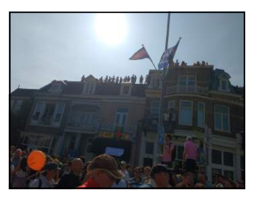
Spectators on the rooftops on the Via Gladioli.

The temperature in the afternoon reached 36 deg C. Fortunately, numerous households had hosepipes. spraying water onto the road for walkers to walk under or for filling up large buckets. The large buckets were useful for dipping your hat or neck scarf into to try and cool you down to avoid sun stroke. During the day, Wendy started to experience a lot of foot pain and we assumed the hot temperatures were causing her feet to swell excessively. We stopped several times to try different things, but in the end we cut off the toe portion of her outer socks to give her feet more room inside her shoes. This appeared to do the trick. I ended up with two small blisters at the end of the day. the first in all my training: I can only assume the hot weather was to blame. When we met up with Simon in the