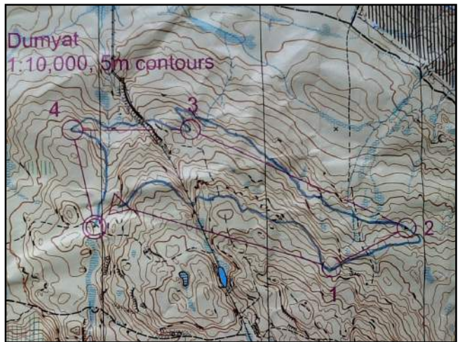
The last day of Above is an example of the types of areas we had to train on. (This is Dumyat - Wednesday). The (editor:curved) blue line is the route that I took, which I drew on afterwards, as part of my post-race analysis.