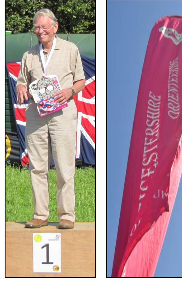
British Middle Distance Championships, 2014, M80 class, 1st Place: