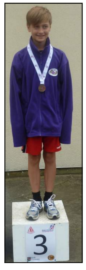
British Sprint Championships 2014, M10 class, 3rd Place: