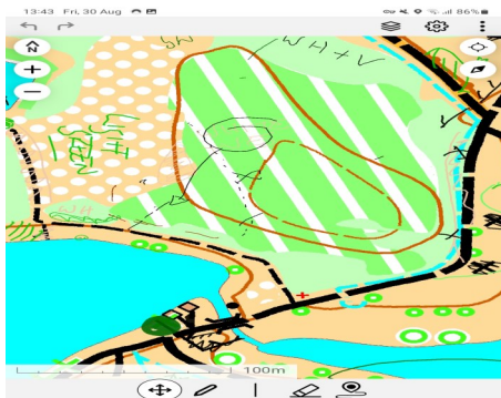
Mapping Advances OCAD Sketch App from page 25